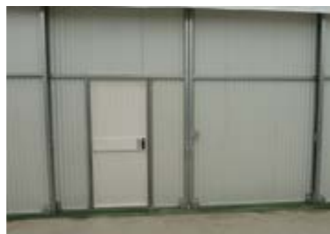
DOOR & GATE SYSTEMS