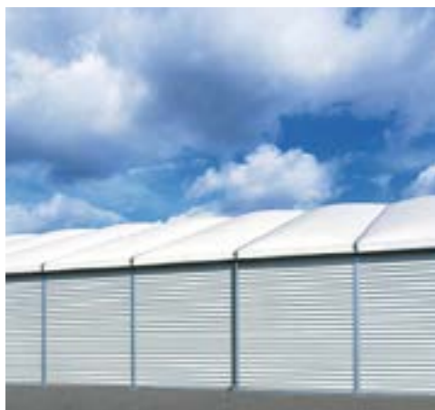
TARPAULINS & FACADE SYSTEMS

The RÖDER Group uses only the most qualified staff, the best materials and constantly draws on its decades of experience in the field of temporary accommodation – right from the very start of the construction and production process of the tent and marquee systems. We achieve high customer satisfaction through quality and safety. Continuous and reliable quality management means we can place our trust in the materials we use. The RÖDER Group is certified according to the European standards EN ISO 9001:2008 and EN ISO 14001:2009. All structures are calculated and tested in accordance with the European standard EN 13782.