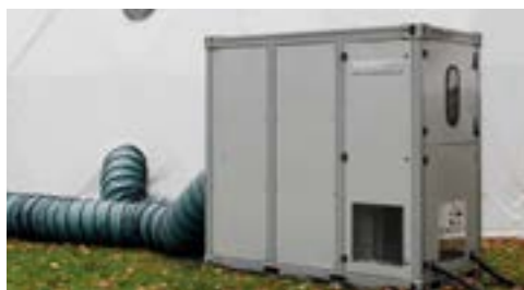
HEATING & AIR CONDITIONING SYSTEMS