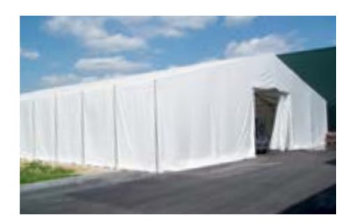
IKEA SALES TENT