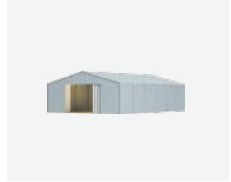
5 m, 7.5 m, 10 m, 12.5 m, 15 m, 17.5 m, 20 m