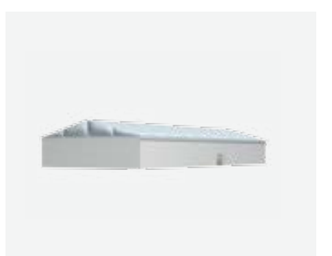
10 m, 15 m, 20 m