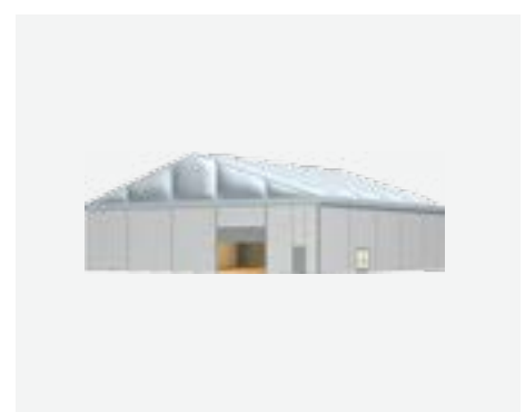
10 m, 15 m, 20 m, 25 m, 30 m, 40 m